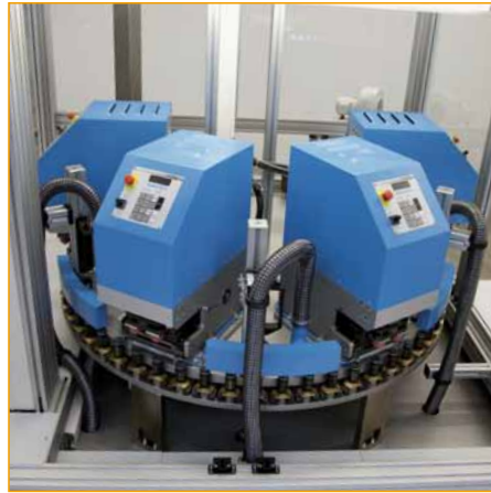
Combination example "Top Spin LC" (circular printing) + "Speed Modul" (top printing) printing of LongCaps (closures).