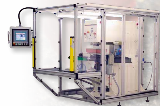
Reference: Electrical connector strip