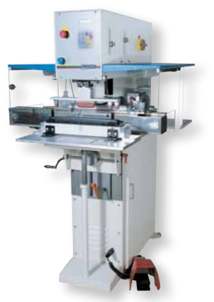
"TSQ 60 - 350/510/710"