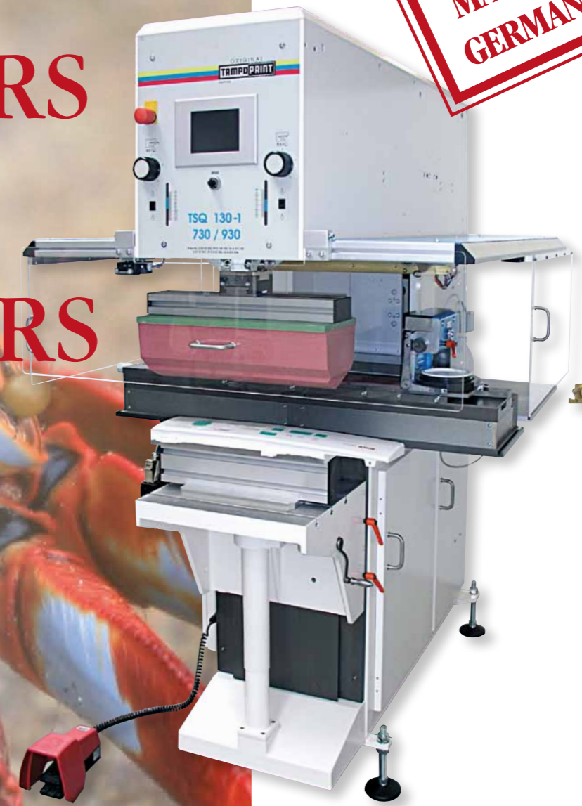
"TSQ 130-1 - 730/930"

The option of setting the doctor stroke to different cliché widths (= printing motif) is also a standard option.