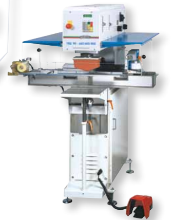
"TSQ 90 - 440/600/800"