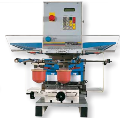
"TSG 80/60-90/41 Compact"