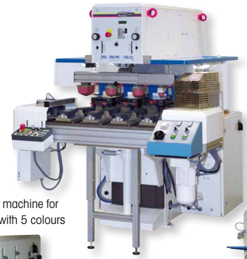
Reference: Semi-automatic machine for the decoration of golfballs with 5 colours