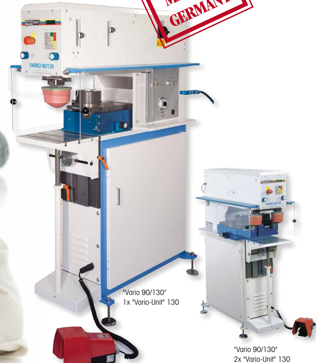
"Vario 90/130" 1x "Vario-Unit" 130